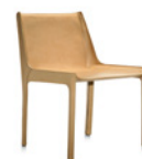
Nisida FG 342.00